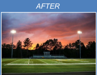
New field, field lighting, bleachers