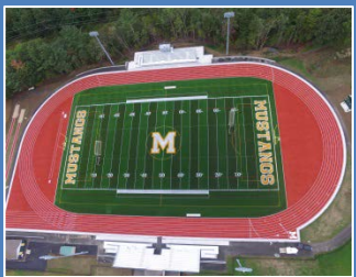
New field, field lighting, bleachers, track